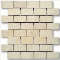
1.5x2.5 Brick Mosaic.jpg Shown in Stone Ivory