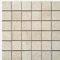
2x2 Square Mosaic.jpg Shown in Stone Ivory