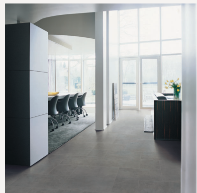
Conference Center_Stone Anthracite.jpg