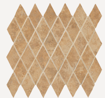
2"x3½" Diamond Shown in Elios