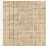
1"x1" Square Shown in Creta