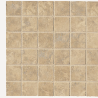
2"x2" Square Shown in Acqua