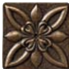
UJ6V Bronze Floral Insert 4"x4"