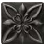
UJ7Z Wrought Iron Floral Insert 4"x4"