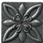
UJ6U Nickel Floral Insert 4"x4"