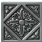
UJ62 Nickel Diamond Insert 4"x4"