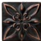
UJ7Y Venetian Bronze Floral Insert 4"x4"