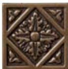
UJ63 Bronze Diamond Insert 4"x4"