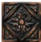
UJ76 Venetian Bronze Diamond Insert 4"x4"