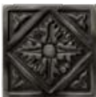
UJ77 Wrought Iron Diamond Insert 4"x4"